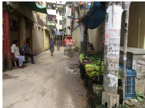
SL#16, Soharab Bepari at North Shajahanpur Road