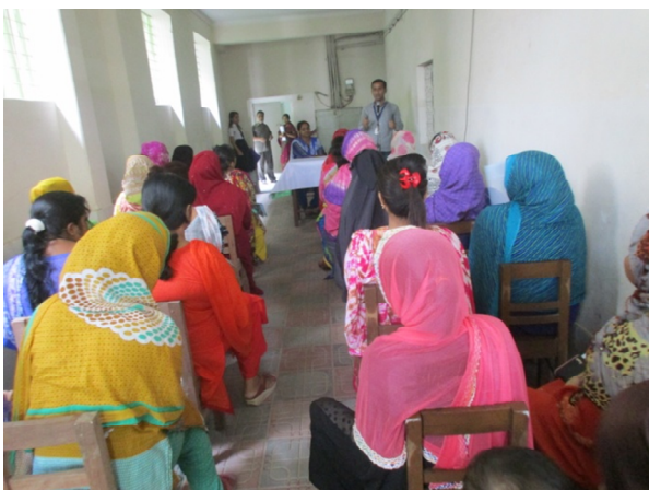
Public Consultation Meeting on 24.08.2017