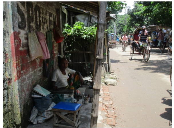
SL#04, Khirud at Mirja Abbas Road