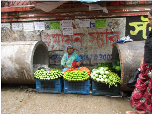
SL#25, Shanaj at Shantibag Road