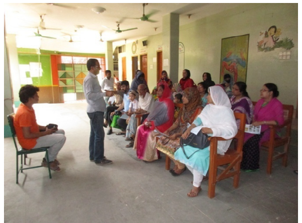
Public Consultation Meeting on 21.08.2017