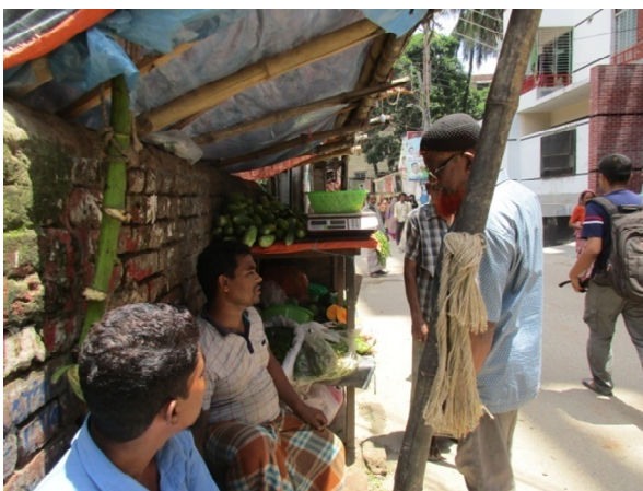
AP selection Process on 06.08.2017