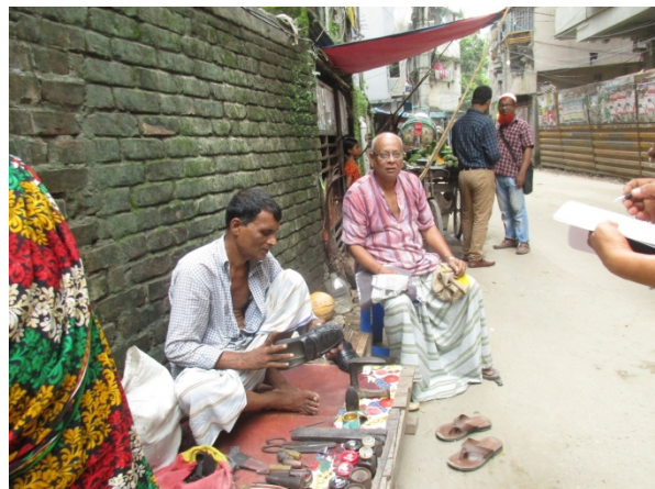
SL#18, Sottyten at North Shajahanpur Road