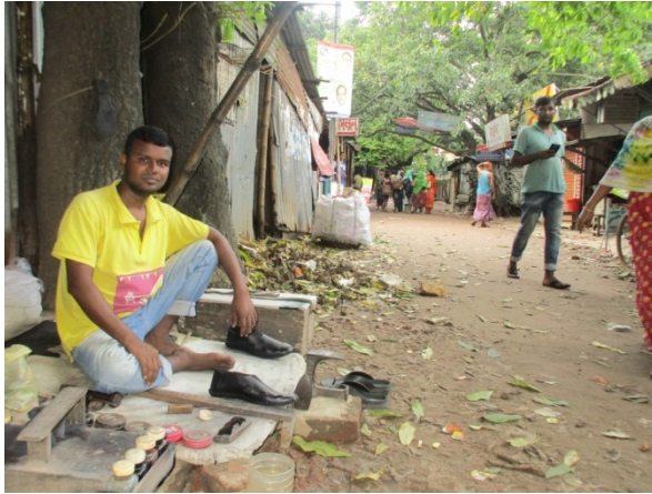
SL#07, Hirodoy at Benjir Road