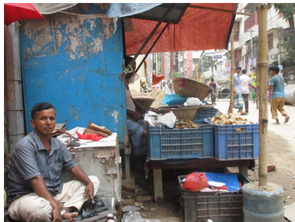
SL#23, Ratan at Shantibag Road