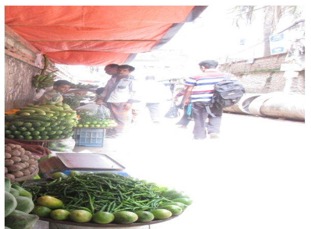
SL#28, Diadarul Islam at Shantibag Road