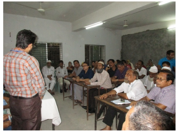
Public Consultation Meeting on 10.08.2017