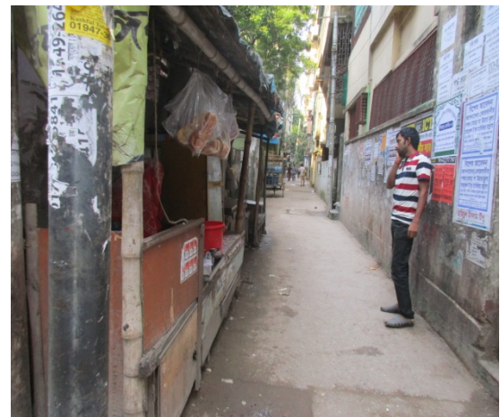
SL#10 ,Ali Akbar at Mosjid Goli