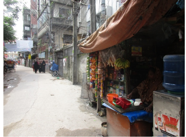
SL#20, Sanowara Begum at North Shajahanpur Rd