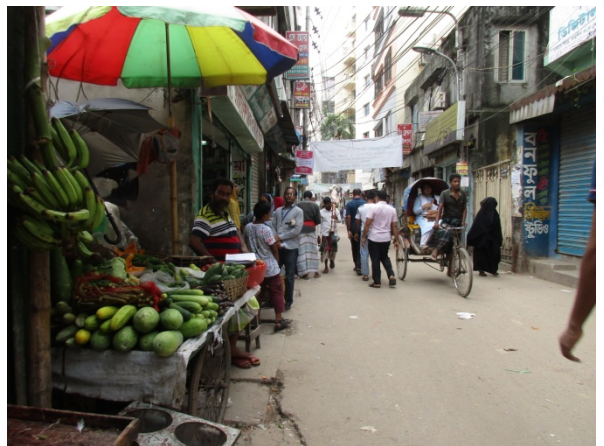
SL#22, Jakir Hossain at Shantibag Bazar Road