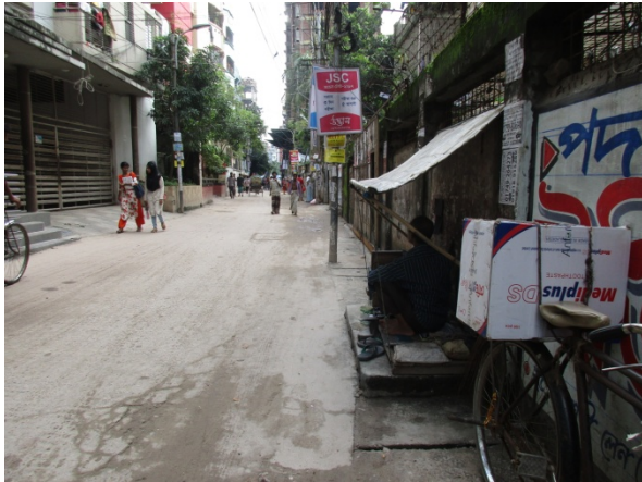
SL#39, Narayan at Bazar Road