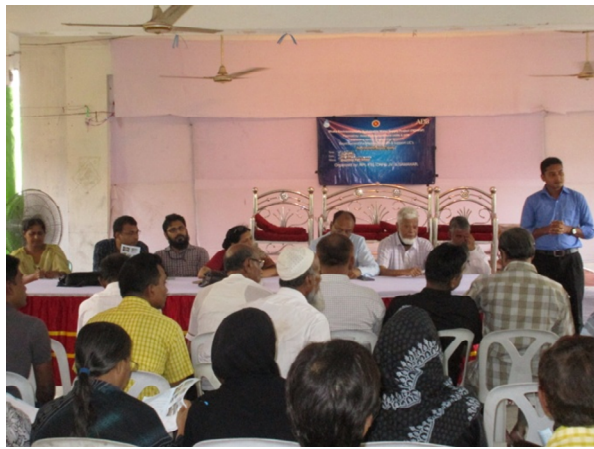
Project Information Disclosure Meeting on 17.08.2017