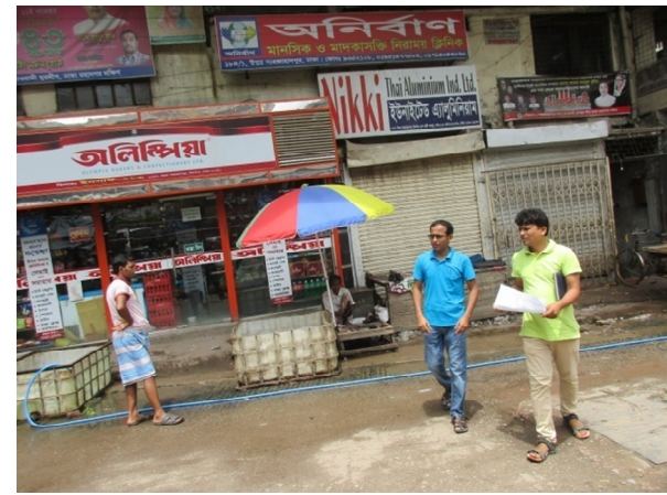
Road Reconnaissance Survey on 02.08.2017